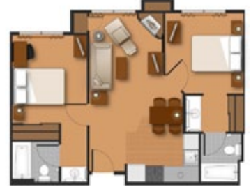
Two bedroom/two bath suite