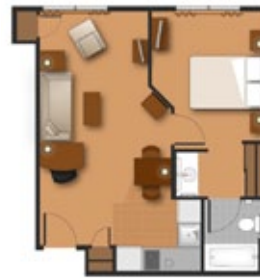
One bedroom suite